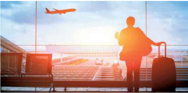
There are at least a dozen travel-related companies globally which are in the midst of being listed or have already gone public

The travel industry has been hit hard by Covid. It has caused several unorganised players to shut shops whereas the revenues of big players have plummeted. Experts said, there has been