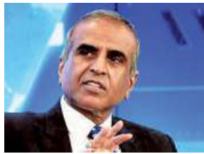
Sunil Bharti Mittal

The Board of the company, on Sunday, decided to raise fresh capital by way of a Rights issue. The company has pegged the rights-entitlement ratio at one equity share for every 14 equity shares held by eligible shareholders as on the record date. Further, the Board consti-